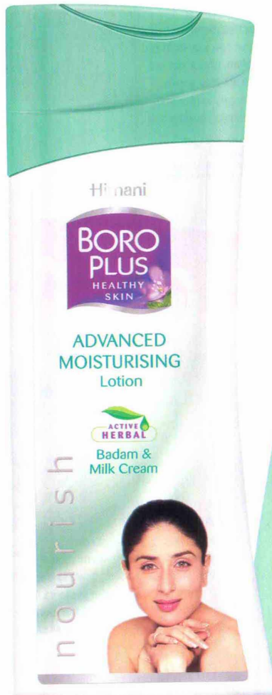
'An Ayurvedic Medicine'

C hilly winds take moisture away from your skin, leaving it dry and rough. Boroplus Advanced Moisturising Lotion's active herbal formula contains nourishing badam and moisturising milk cream. These ingredients penetrate deep into your skin and maintain the balance of moisture in your skin, keeping it supple and healthy. Boroplus Healthy Skin keeps your skin soft, supple, and fresh—even during winter.